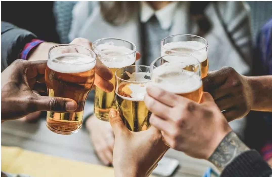
The inaugural Long Beach Beer Week is coming to the city Sept. 13-22.

The inaugural Long Beach Beer Week is set for Sept. 13-22.